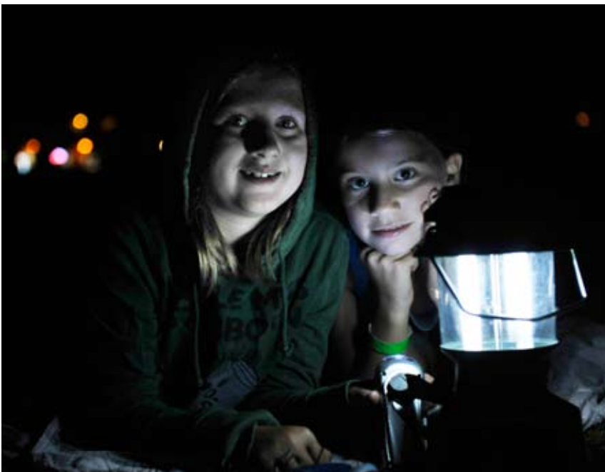
Campers resting after Wednesday night's fire works show. The show was moved from Friday night to give volunteers time to set up a thank-you banquet for summer staff.